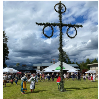
So many people came to dance around the mid- summer pole.