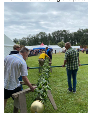
The men in the pole position