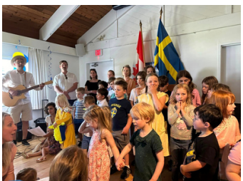
Swedish School students