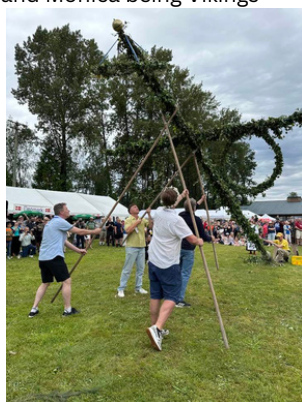
The men are raising the pole