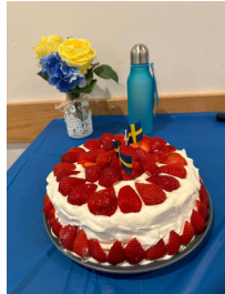
Strawberry cake on National day